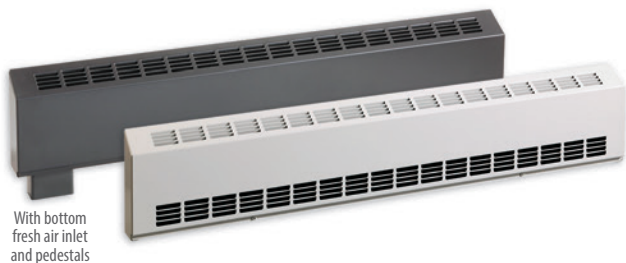
With bottom fresh air inlet and pedestals