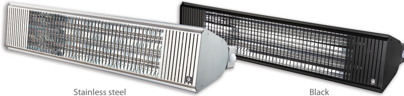
Stainless steel OCF30240, OCF40240, OCF60240