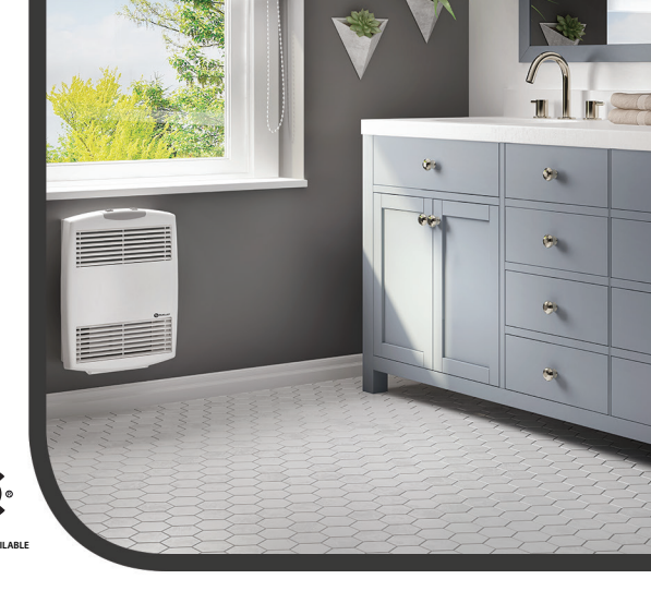
Training available online www.ouellet.com